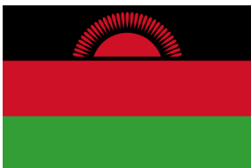
Flag of Malawi

There will be a supply of Blythwood Care Shoebox Appeal leaflets in the Church from the beginning of September. If you wish to make a donation online, check how to pack the shoebox, or download the checklist and donation form online: you can do so at www.blythwood.org , or also at www.shoeboxappeal.org .